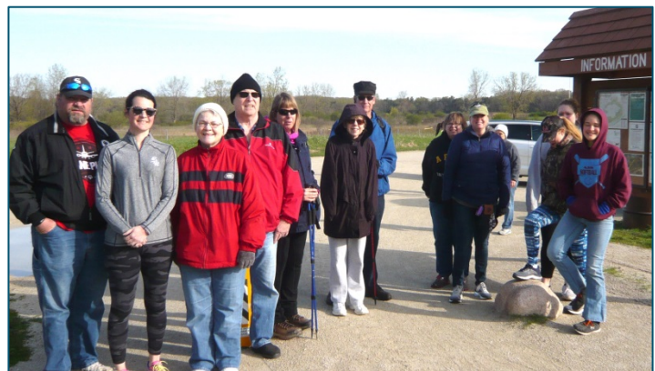
May 2019 WFG Hikers

With the success of social media marketing, we hope to see larger crowds at the future hikes. If anyone has any questions about the trails or future hiking events, please contact the historical society.