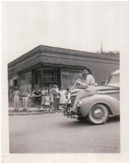
Berlin's Candy Corner

To prepare for future scanning, write what you already know on the photo back; add names, approximate dates and locations. Years from now when someone finds that stack of old photos,