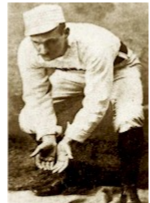
Bill McPhee