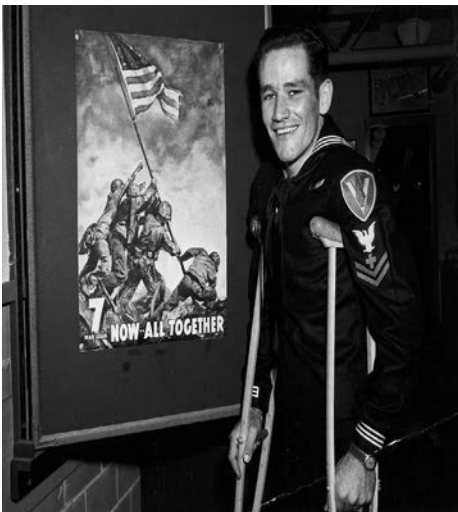
Pharmacist's Mate 2nd Class John Bradley toured the country on the Seventh War Loan Drive in May and June of 1945.

After the flag raising Bradley continued his corpsman duties. On March 12, 1945, he incurred shrapnel wounds in his legs and was evacuated. During May and June of 1945, Bradley and two other flag raisers, PFC Rene A. Gagnon and PFC Ira H. Hayes toured the U.S. on the Seventh War Loan Drive.