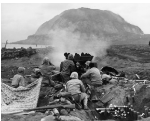
Firing on Japanese positions on the slopes of Mt. Suribachi, where the enemy kept up constant fire on the Marines, February 21, 1945