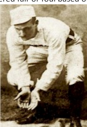
Bill McPhee (public domain)

Source: www.vbba.org/history-of-base-ball